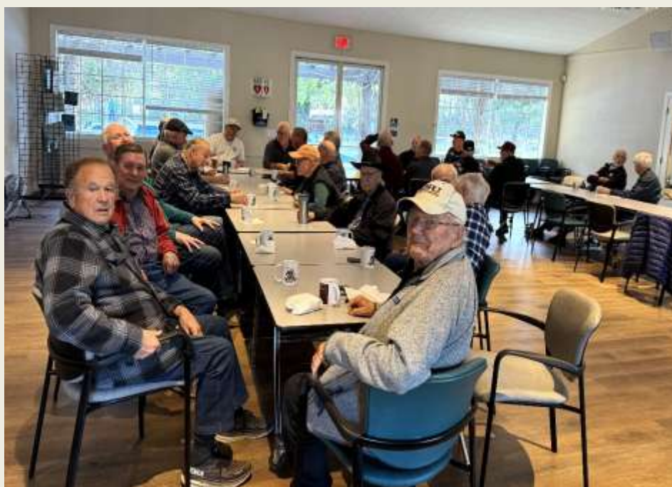
Coffee at the senior center

Bringing a guest to coffee for them to get a feel for the group is a simple and great way to recruit. Tuesday Morning 9am coffee session continues to be busy and a fun time.