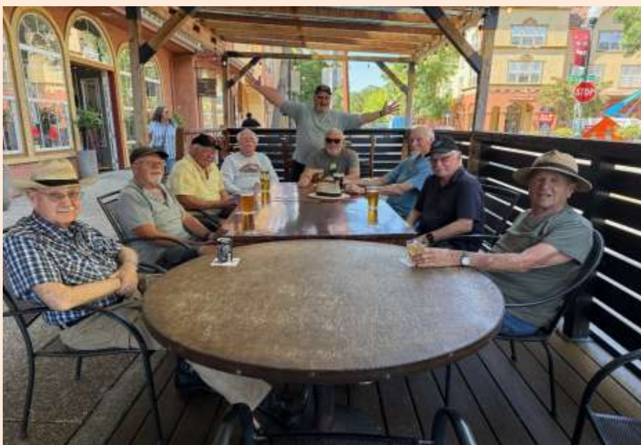
At The Publican

If you are free, come and enjoy a cold beverage and lively conversation and so-so jokes. The schedule for JULY is: 7/4-- Lupe's; 7/11-- Cu'Ver; 7/18—Charlies' 7/25-- Flavorburger.