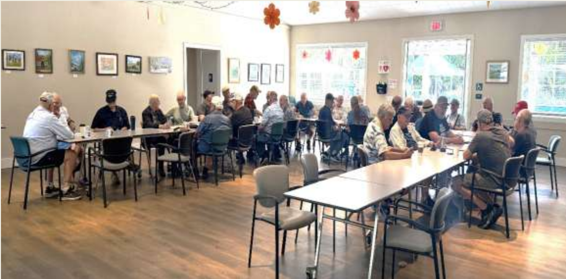
Coffee at the senior center

Bringing a guest to coffee for them to get a feel for the group is a simple and great way to recruit and catch up on all the world events. Tuesday Morning 9am coffee session continues to be a popular and a fun time.